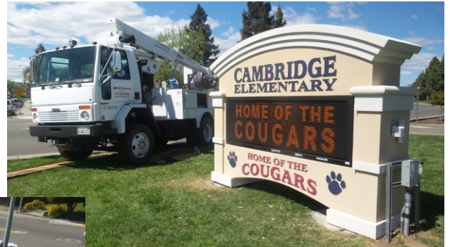
EMC Message Display & Surround Installed For Signs Plus