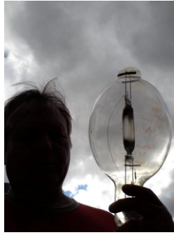
HID to LED