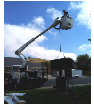
1000# Load Lift

website: uswestsigns.com email: uswestsigns@comcast.net FaceBook: USWEST Sign & Lighting