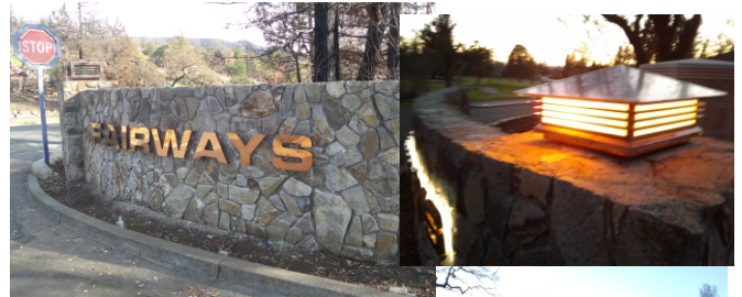
Neon Channel Letters and Column Light HID to LED