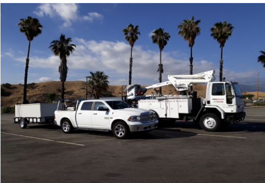
Pick-Up w/Utility Trailer

EQUIPPED TO SERVE YOUR SIGN & LIGHTING SERVICE AND INSTALLATION NEEDS