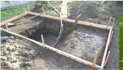
Foundation & Concrete Work

Site Surveys-Digital Photography Design/Drawings for Permits Vinyl Graphics Installation