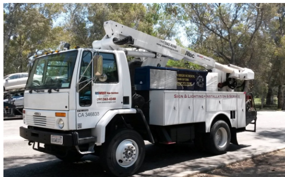
50 Foot Reach Articulating Boom