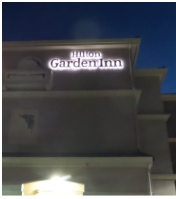
Neon to LED

Reduces Frequent Service Calls More Efficient Lighting Saves Energy Costs